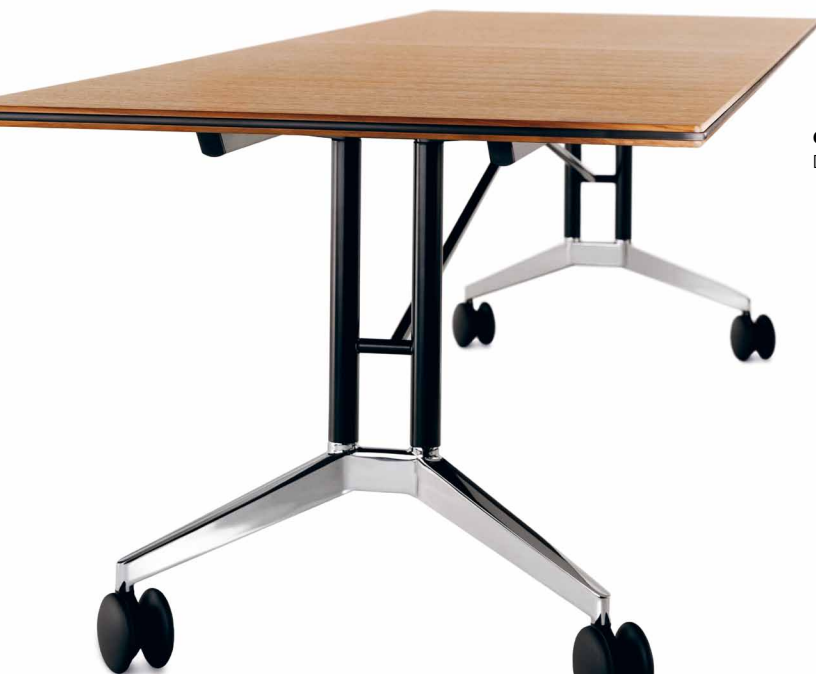
Confair folding table Design: Andreas Störiko

The sophisticated folding technique and the large lockable wheels, as well as the elegant design and high-quality materials, are equally responsible for the table's success. The table's structure makes it simple to use and transport. The look of the table reflects communication at a high level: from the conference and project-work room, to top-level executive offices. As options, cable channels, power supply connections and innovative techni-modules ensure interactive access to state-of-the-art multi-media equipment is so easy it has to be believed. The table is the perfect mix of well-used space, aesthetic appeal and advanced technical functions.